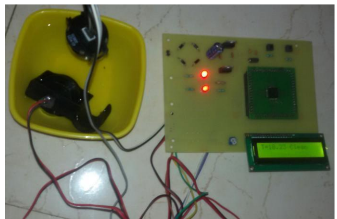
Figure 7 Hardware setup .