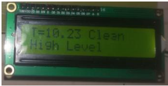
Figure 3 LCD display unit.