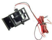
Figure 4 Magnetic float sensor.

Specifications: Level measurement type - High/low. Switching capacity - 10W Switching voltage - 0.5 Amp.max. Switching voltage - 25v DC max. Cable - two cores