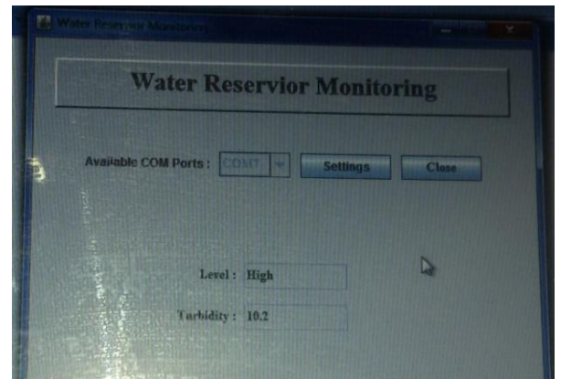
Figure 6 Displaying Turbidity sensor and level sensor values.