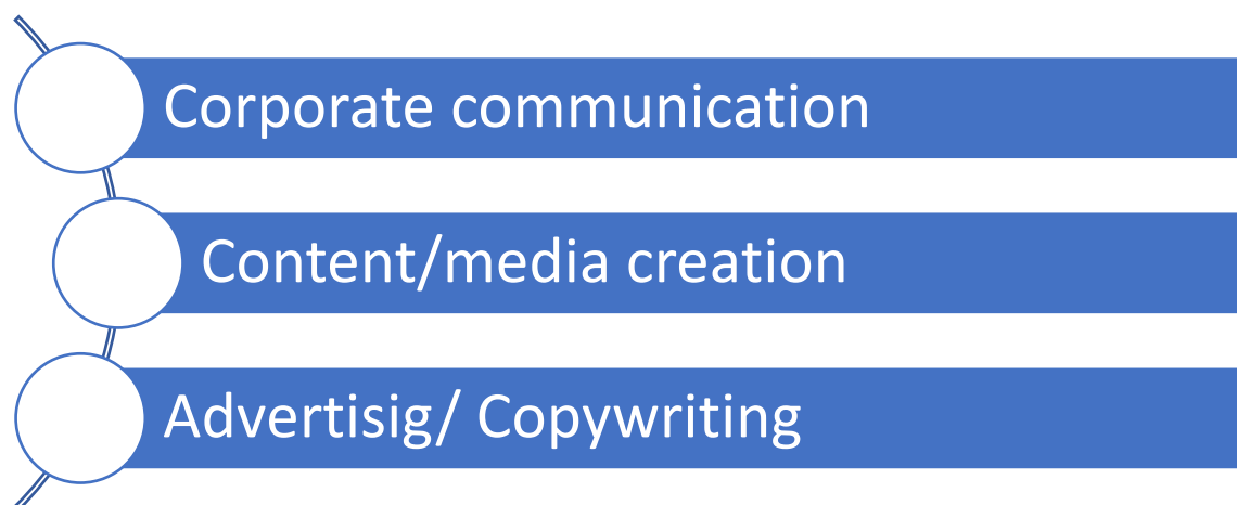
Fig.2 Professional scope of English literature