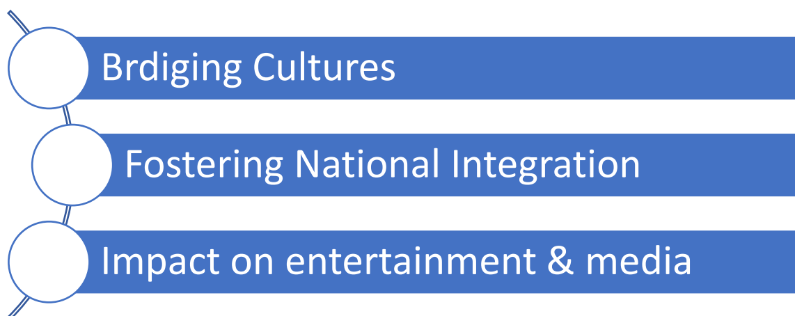
Fig.3 Scope of English literature in cultural & entertainment field

In India, English literature has a significant and shifting cultural and socioeconomic impact. It connects India to the outside world and acts as a mirror reflecting the complexity of society. English literature continues to be essential in forming India's cultural and socioeconomic narrative because it encourages discussion, encourages inclusivity, and challenges conventions.